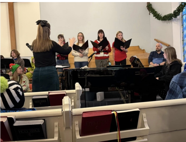
Above: The C-S High School choir sings during the Christmas in Climax event.