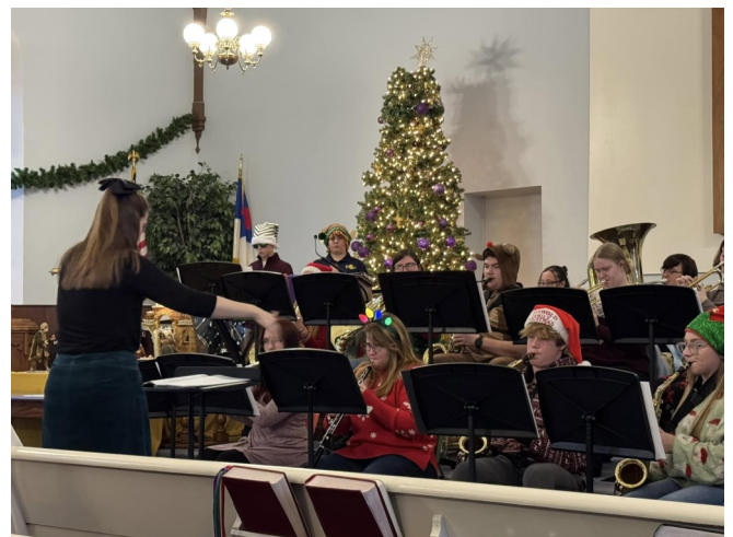
Above: The C-S High School band performs at Climax United Methodist Church.