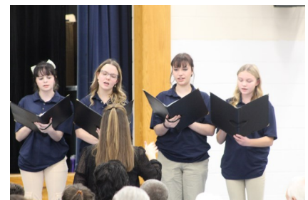
Above: The C-S Choir.