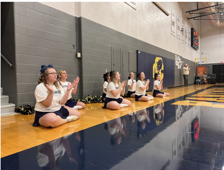
Above: The C-S sideline cheer team performs during the Varsity Boys' basketball game against Lawton.