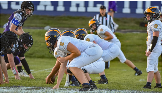
Above: The team lines up against Athens.