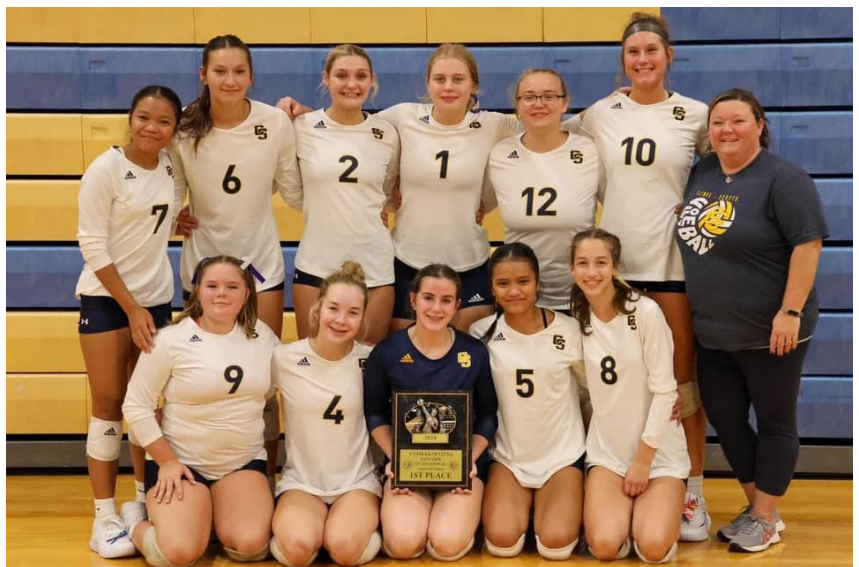
Above: The Climax Scotts Varsity Volleyball proudly shows off their plaque after winning the Panther Invitational.