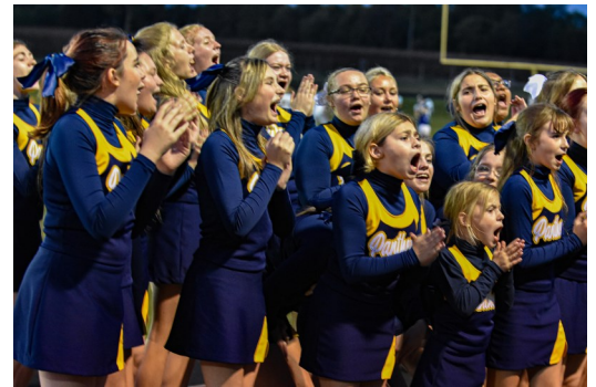
Above: The Sideline Cheer team gets the crowd going!